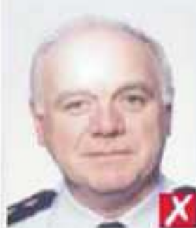
flash reflection on skin