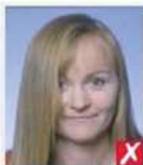
hair across eyes