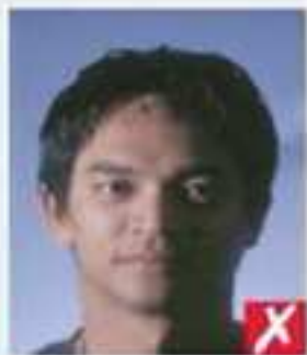
shadows across face