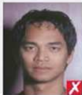
shadows behind head